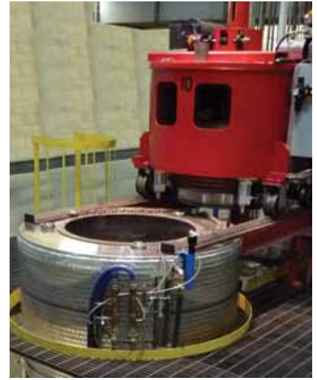
Pressure Technology HIP Unit

This article offered by Pressure Technology with input from Kovatch Castings..